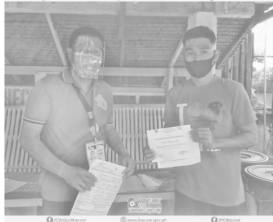
CityGovBacoor www.bacoor.gov.ph PIOBacoor