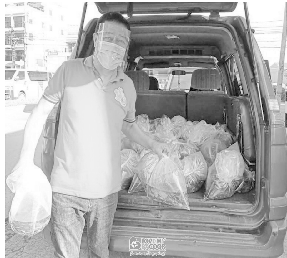
CityGovBacoor www.bacoor.gov.ph PIOBacoor

Namahagi ng humigit kumulang 30,000 Genetically Enhanced Tilapia Fingerlings (GET-Excel) ang Pamahalaang Lungosod ng Bacoor City Agriculture Office para sa mga fisherfolks nito na nagpahayag ng kagustuhang ipagpatuloy ang operasyon ng kani-kanilang mga palaisdaan. Katuwang ang Kawanihan ng Pangisdaan at Yamang Tubig-Provincial Fishery Office, ang mga fisherfolks ay nabahagian ng tig-lilimang libong fingerlings ng tilapia para sa kani-kanilang mga palaisdaan. Layon ng pamamahaging ito na muling buhayin at bigyan ng dagdag kita at makabuluhang mapagkakaabalahan ang mga mamamayang Bacooreño na mayroong palaisdaan sa panahon ng pandemiya.